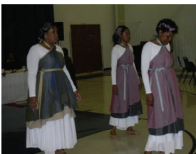
St. Matthew's Baptist Dance Group